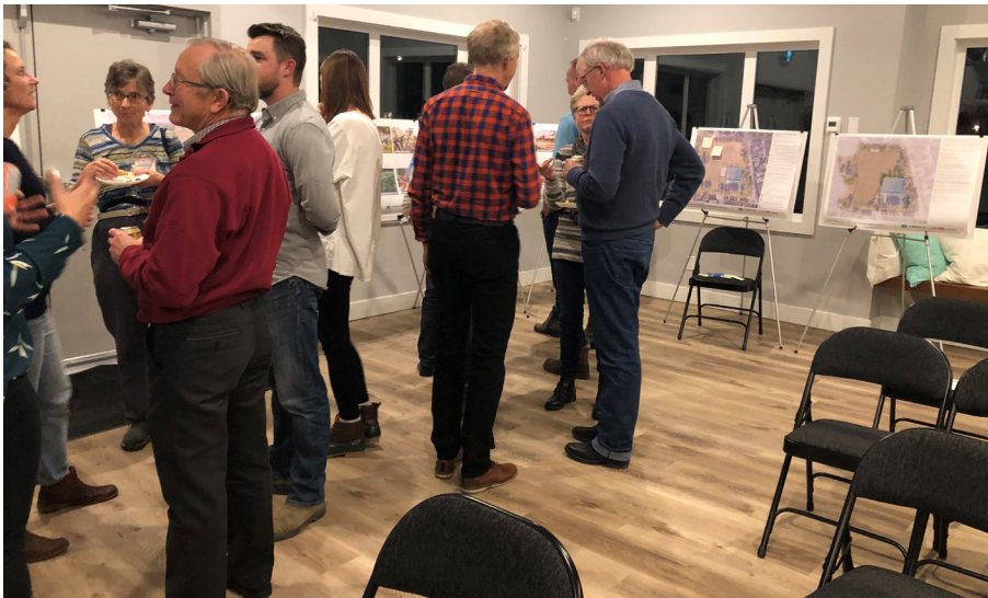
Community Engagement Session at AGM for Concept Plan and Storage Facility