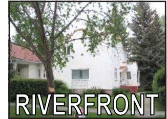
ELBOW PARK Offered at $1,895,000