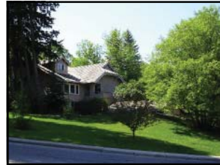
ELBOW PARK Offered at $1,425,000