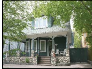
ELBOW PARK Offered at $998,500