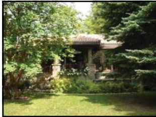
ELBOW PARK Offered at $949,000